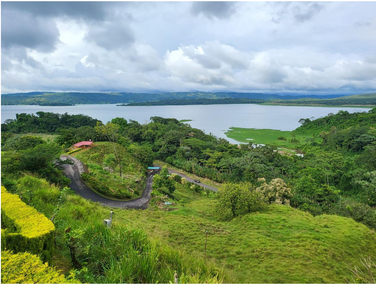
Photo: Hilltop restaurant overlooking Lake Arenal.